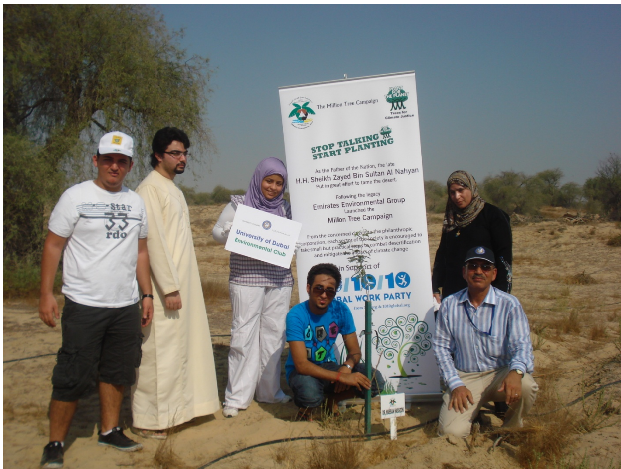
UD students, participating in the plant-a-tree campaign organized by Dubai Municipality

As the university is committed to the sustainable use of paper, electricity and water, it also takes extra efforts to recycle waste paper. This year, UD participated in the campaign organized by Dubai Municipality on October 10, 2011. The campaign involved providing an opportunity for organizations to plant a tree at the Mamzar Park for every 50kg of waste paper collected for recycling.