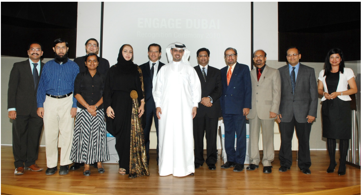
Members of ENGAGE Dubai at the reward ceremony with the Director General of the Dubai Chamber

UD is an active member and partner of ENGAGE Dubai, an employee volunteering organization with fifty member companies. This is an initiative of the Dubai Chamber. As a partner of ENGAGE, UD has brought 15 executives as guest speakers from participating organizations to lecture to students during the past 24 months. UD faculty also participated in different employee volunteering activities organized by ENGAGE.