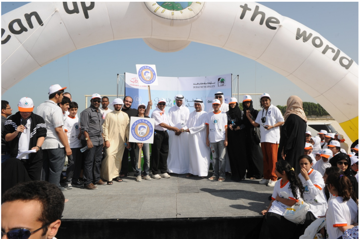
UD students and staff receiving memento for participating in the clean-up campaign

Each year students from UD participate in clean-up campaigns organized by United Nations Environmental Programme in association with Dubai Municipality. This year's event was held on October 28, 2011. In addition, students and faculty cleaned the non-residential areas of Nad Al Sheba in Dubai under the auspices of the Emirates Environmental Group (EEG).