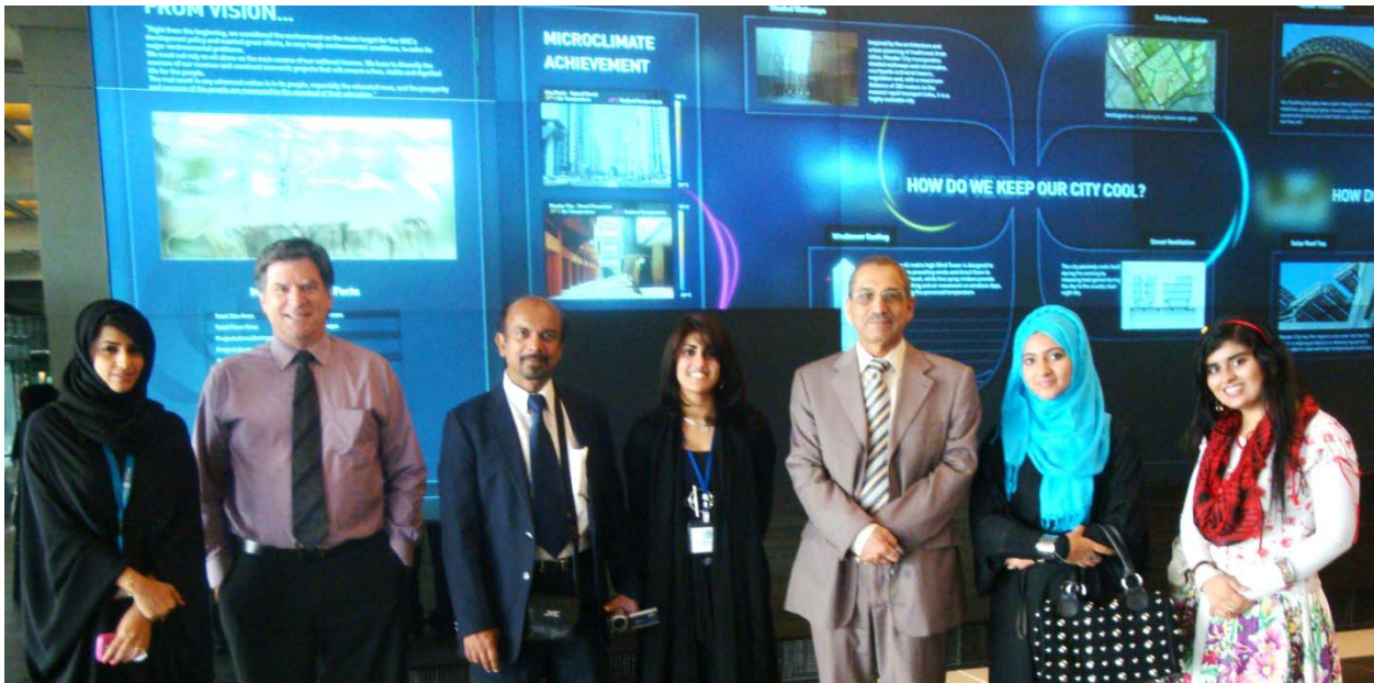
UD students and faculty members attending a presentation at Masdar University, Abu Dhabi

Students and faculty members attended the World Future Energy Summit, Abu Dhabi, hosted by Masdar City and later visited Masdar University and other facilities in the City. Students attended a presentation of the special features of the city and how they maintain sustainability through various projects.