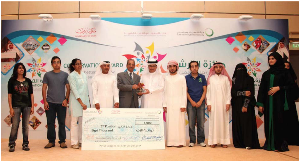
UD faculty, staff and students receiving the award from DEWA officials

In association with the Dubai Water and Electricity Authority (DEWA), UD conducted a workshop on conservation of water for students, faculty and staff on May 18, 2011. Officials from DEWA emphasized the need for water conservation and showed different methods of implementing them. On February 16, 2012, UD was recently awarded second place for its conservation efforts from DEWA. UD was given the 'Conservation Award – For a Better Tomorrow' for its reduction of water consumption by 9%, electricity by 23% and great efforts around campus by the environmental club and faculty, UD was awarded a cash award of AED 8,000. Students and staff also attended a range of seminars on keeping pace with the latest developments in the fields of energy, water and environment, hosted by the Supreme Council of Energy and Dubai Electricity & Water Authority.