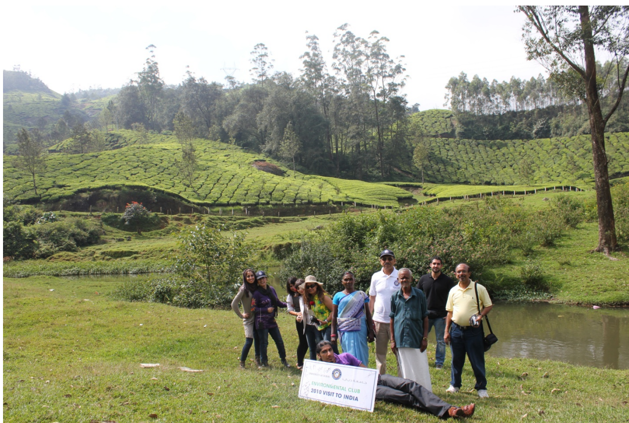
UD students and faculty with local workers in Munnar tea gardens, Kerala, India

In association with the environmental club of UD, students and faculty members made an eco-friendly tour to Kerala, India. They visited the eco-tourism areas such as tea plantations, botanical garden, spice garden, hydro-electric project. They also went on an elephant safari, and camped in a boat house overnight. Students got an opportunity to see rare species of animals and plants in the forests of Kerala. They also attended a session of Kathakali, a cultural performance of dance, drama and poetry. The trip enlightened the students on biodiversity, sustainability, cultural diversity and awareness of endangered species.