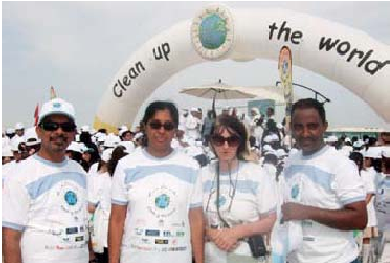
UD delegates at the 'Clean up the World' campaign at Jumerah Beach Park, Dubai.

UD takes part in the 'Clean up the World' campaign every year since its initiation in Dubai by United Nations Environment Program (UNEP) and Dubai Municipality. Several educational institutions volunteered to participate in these events. This year, the event took place on November 1, 2009 at the Jumerah beach, Dubai.