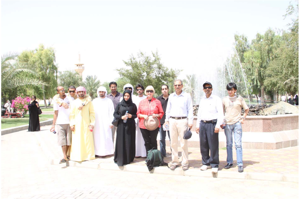
Students and faculty visiting Al Aine Wild Life Park

PRME delegates are active members of the UD Environmental club. Members of the Environmental club organized a one-day trip to the Wild Life Park Al Ain, on March 29, 2010. The trip enhanced the knowledge of the members about the species of Arabian Peninsula, and the endangered species.