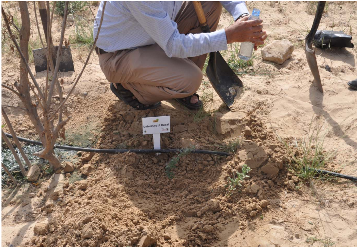
University of Dubai’s tree saplings planted at Mushraf Park during ‘My tree in Dubai’ project.

UD delegates planted tree saplings at Mushraf Park, Dubai for the ‘My Tree in Dubai’ campaign on April 24, 2010. UNEP organized this event as part of the ‘One Million Tree’ project coordinating with Dubai Municipality as the initiator and the main partner. In order to be eligible to take part in the event, each participant had to collect and provide Dubai Municipality with sixty Kg. of used paper suitable for recycling. The event created awareness among the members, the need for protecting the environment by recycling and planting more trees.