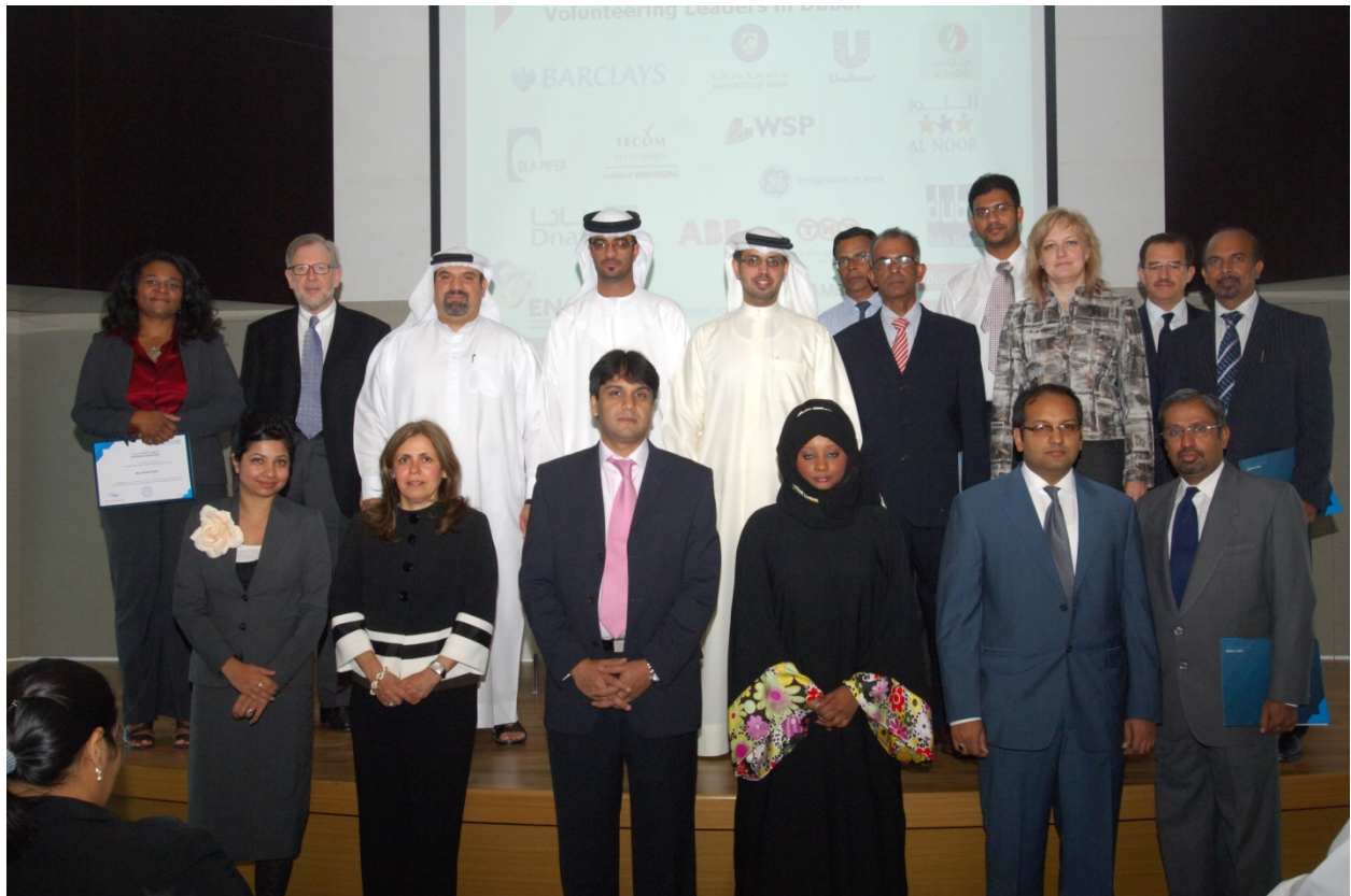
Executives of member organizations of ENGAGE Dubai rewarded for their employee volunteering activities. Delegates are seen with Dubai Chamber and Center for Responsible Business executives.

UD invites company delegates as guest speakers to classes during Faculty for a Day event every semester. For courses such as Business and Society, faculty members assign the member organizations of ENGAGE to groups of students on CSR audit projects. For such projects, students visit the organizations several times, meet the executives, study the ways by which they implement CSR in the UAE, prepare report on the activities, and present them in classes.