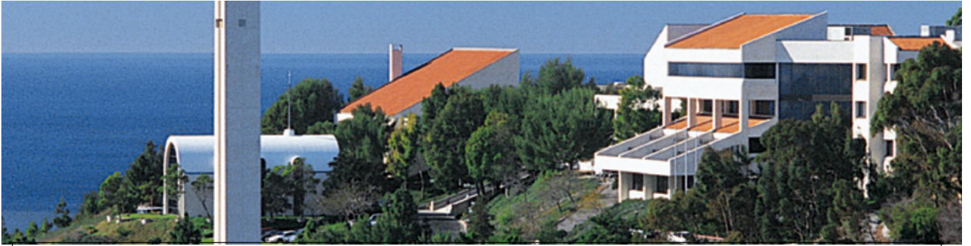
GRAZIADIO SCHOOL OF BUSINESS AND MANAGEMENT