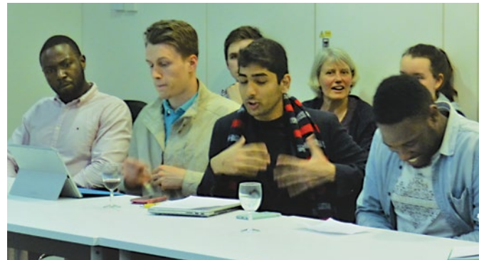
The Banana Debate in full swing; an impassioned contribution engaging debaters and audience alike.

Every year the Business School runs a business ethics debate. These debates are led by our undergraduate students, with postgraduate students joining the audience as well. In 2016 Oxford Brookes business students went head to head with a visiting team from the University of East London debating ethical dilemmas in business, with a £300 prize for the winning team. This was followed in 2017 by the 'Great Banana Debate', with groups of undergraduate students adopting different stakeholder positions to debate the social and environmental issues central to the global banana trade. Masters level international trade and logistics students joined the audience, attracted by the major implications for supply chain management of moving to more ethical (e.g. fair trade) and environmentally sustainable ways of growing and trading bananas. Our undergraduate student debaters were well-prepared, and our postgraduate and other guests took an active role in the to-and-fro of discussion after the initial presentations. What was due to be a one-hour debate was reluctantly brought to a close after two full hours. Debating really sharpens the mind and, on the basis of exchanges in this debate, it seems safe to say that we have many intellectually adept and ethical leaders of the future here at Brookes.