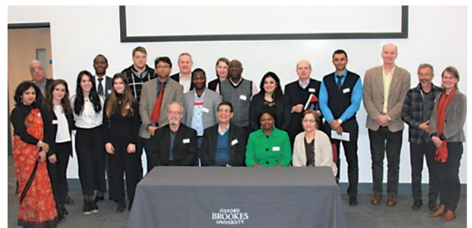
Delegates gather at the end of the 5th International COSINUS Conference, Oxford Brookes, January 2018.

The conference was structured around keynote speeches, panel discussions and parallel sessions. The underlying aim of COSINUS is to promote the role of universities as lead players in the process of technological progress, wealth creation, equity and sustainability.