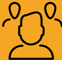
Board of Trustees