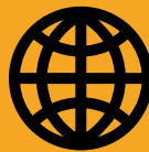
International Advisory Board