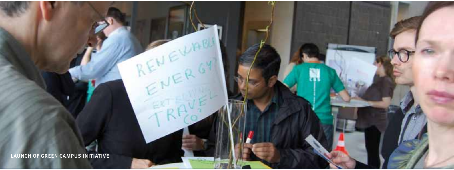
LAUNCH OF GREEN CAMPUS INITIATIVE