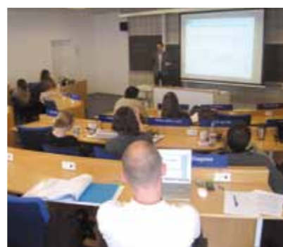
CBS Net Impact MBA chapter launch

comprises primarily members who are either undergraduates or MSc students. Net Impact is an international organisation with over 12,000 members. As a PRME co-convenor, Net Impact is working to get PRME adopted by more business schools, particularly in the US. Committed to supporting Net Impact initiatives, CBS exemplifies how PRME and Net Impact can work effectively together. Successful at integrating sustainability material into school curricula, Net Impact students will act as foot soldiers for the PRME initiative.