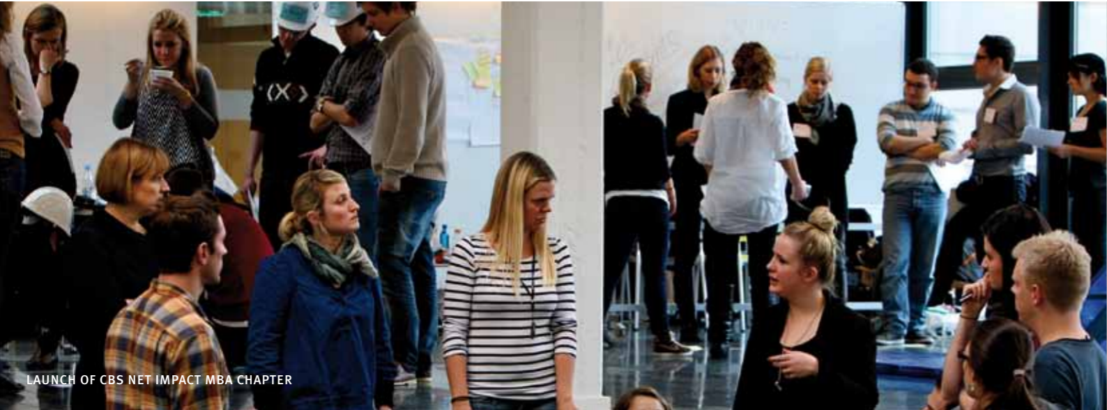
LAUNCH OF CBS NET IMPACT MBA CHAPTER