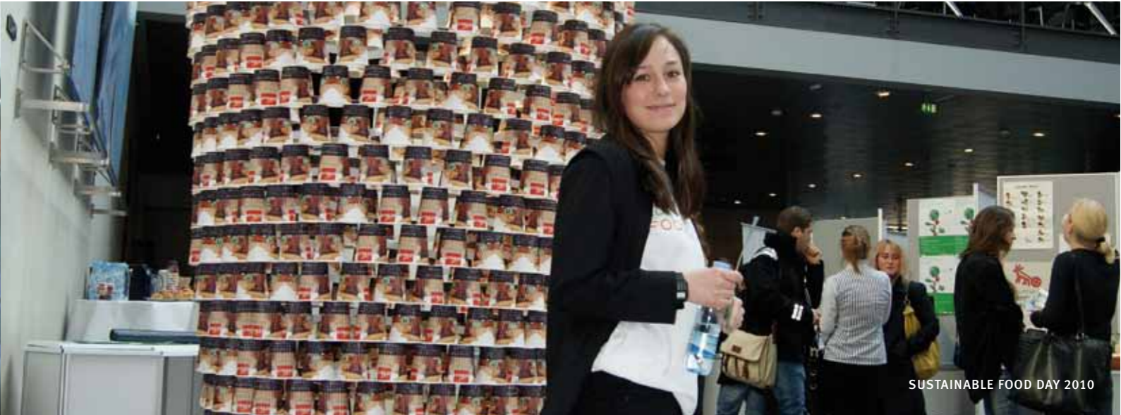
SUSTAINABLE FOOD DAY 2010