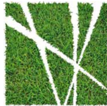
CBS GOES GREEN

Students will be invited to become Green Ambassadors so they can help inform and spread the word about sustainability initiatives as well as help generate solid, innovative ideas. CBS intends to expand the ambassador programme to include CBS staff. Departmentally, each secretariat will appoint an administrative staff member as its principal Green Campus contact. A similar approach will be used for other non-departmental units across campus.