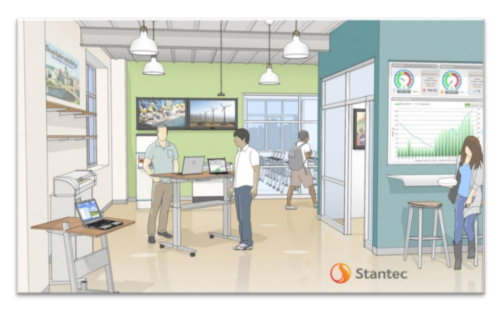
Proposed Institute for Sustainable Business Innovation

The School of Business will create a comprehensive Institute for Sustainable Business Innovation that will be recognized among the finest in the world.