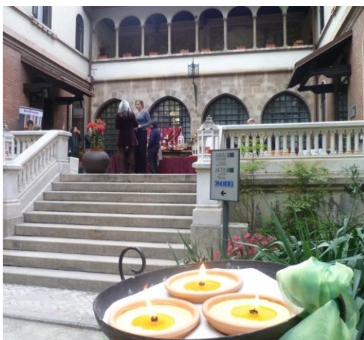
ALTIS hosting an event of Microventures- one of the partner NGOs with which the School cooperates. ,Apr 2012