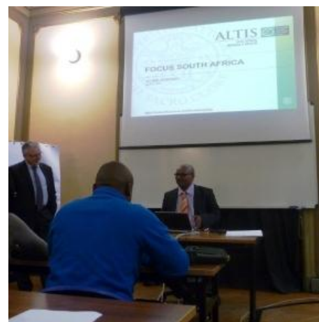
Consul general of South Africa - SK Molobi addressing the MBA class in a Lectio Magistralis (Focus South Africa, 2012)

In order to favor an inclusive and sustainable global economy, a course called Global Strategy is scheduled in the MBA Global Business and Sustainability that is aimed at illustrating the dynamics of BRICS and emerging markets to students, from an economic, business but also social and cultural perspective. Top ranked speakers from the Academy, business environment but also representatives of Institutions are involved in this course.